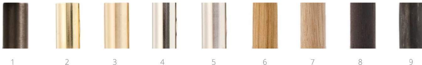
1. Burnished Brass (BB) 2. Polished Brass (PB) 3. Satin Brass (SB) 4. Polished Nickel (PN) 5. Satin Nickel (SN) 6. Teak (TE) 7. Oak (OA) 8. Wenge (WE) 9. Black Horn (BH)